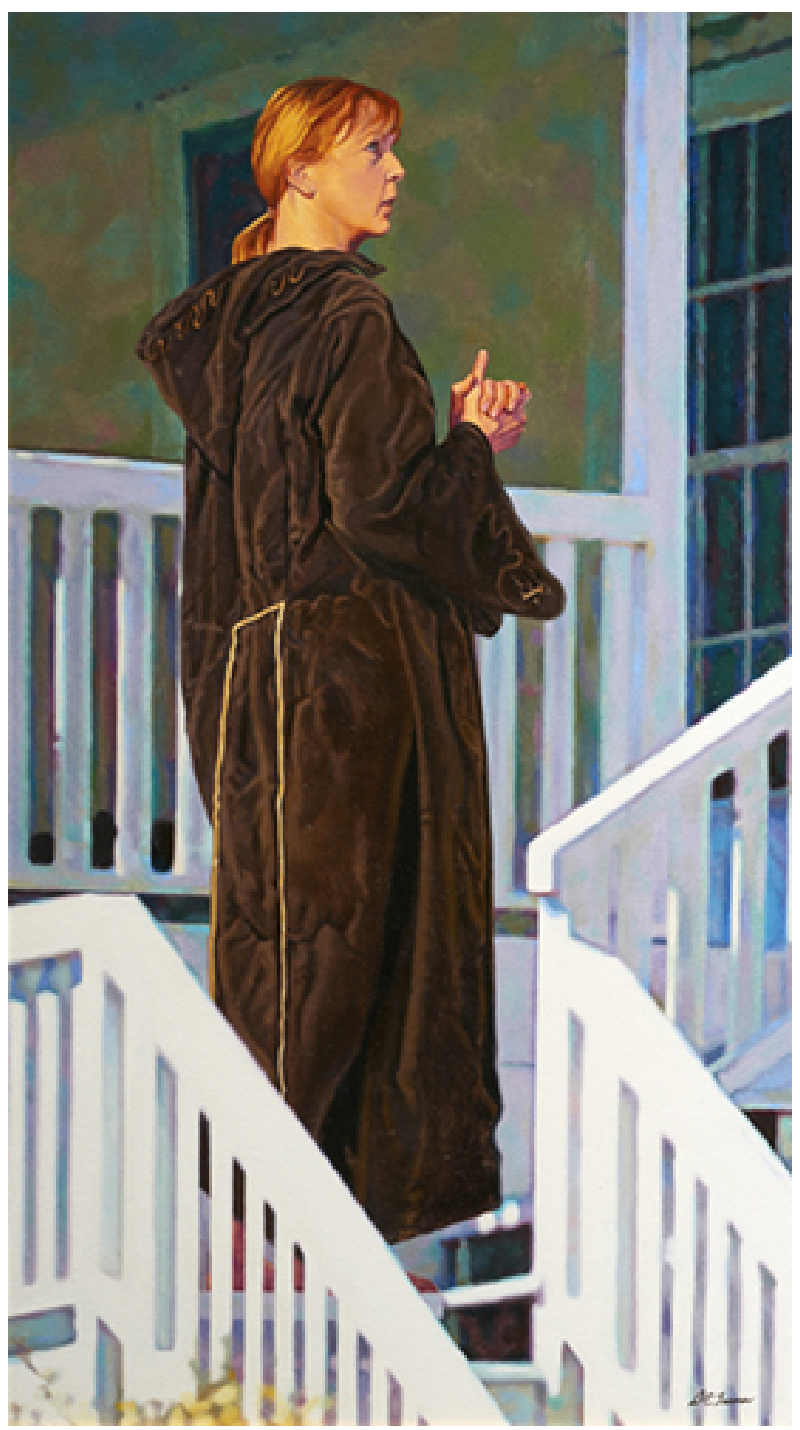
"Contemplation" oil on canvas, 32" x 18"