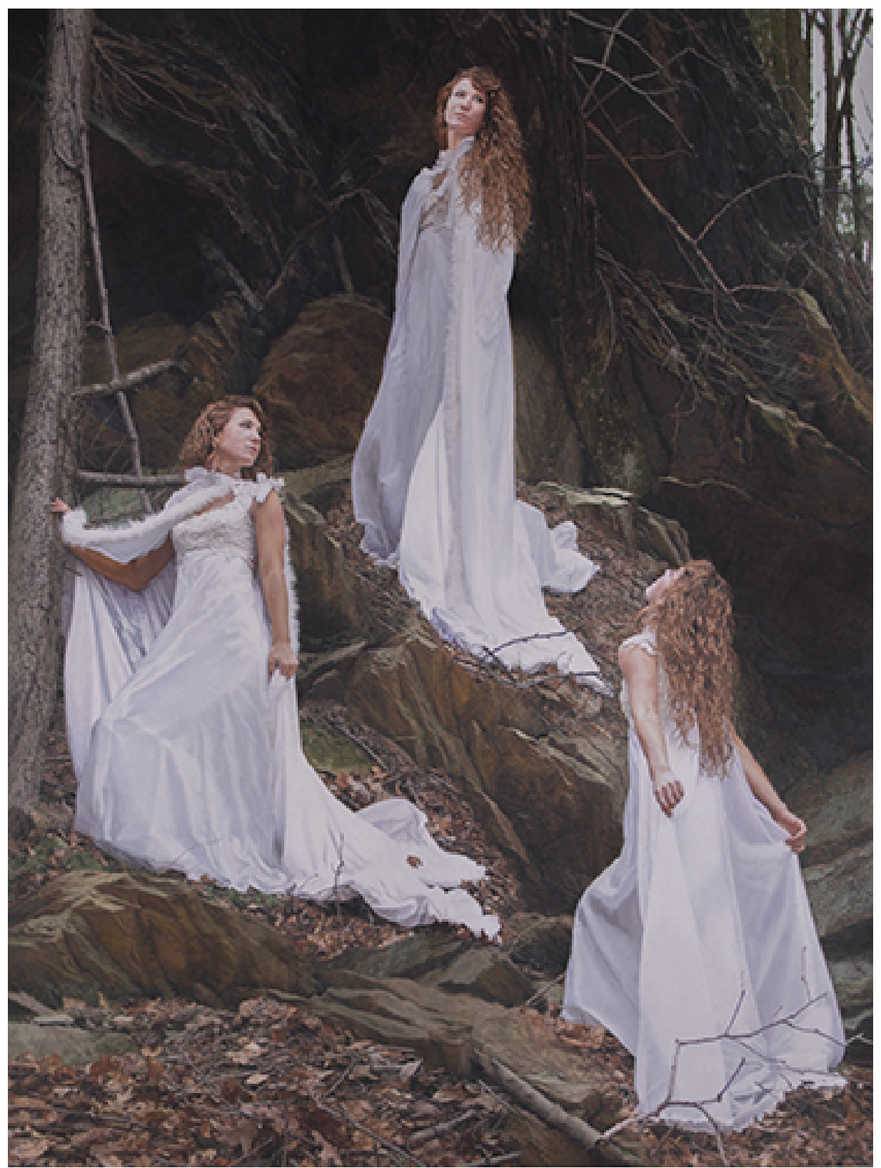
"Triplets in White" oil on canvas, 40" x 30"