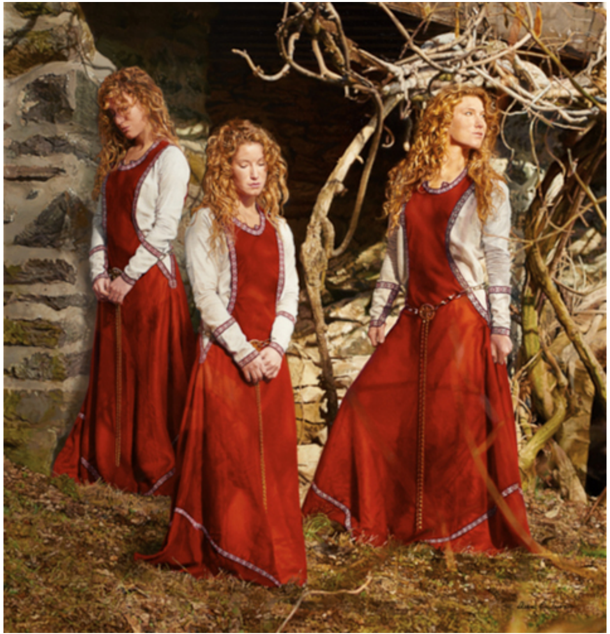
"Triplets" oil on canvas, 36" x 34"

Then I make a finished drawing and transfer the major reference points on to the canvas, panel, or in the case of my gouache paintings, Bristol board, with graphite. My painting method starts with establishing the darkest darks. When using oil paint I apply it straight out of the tube in a very thin layer. One or more subsequent and also thin layers are needed until the result is opaque.