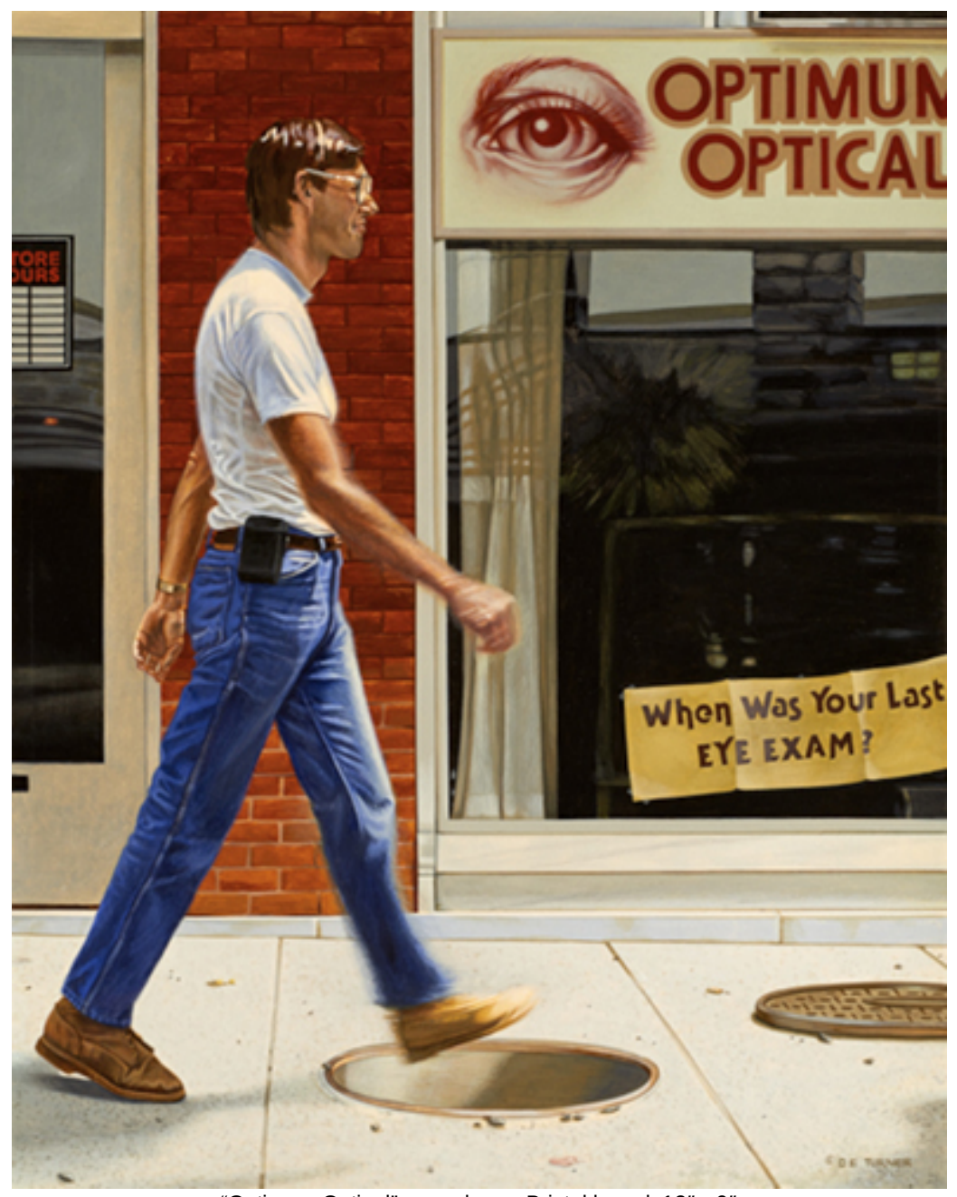
"Optimum Optical" gouache on Bristol board, 12" x 9"

My people sometimes find themselves in humorous situations. At other times they are caught in deep reflection in a place where they enjoy heavenly solitude.