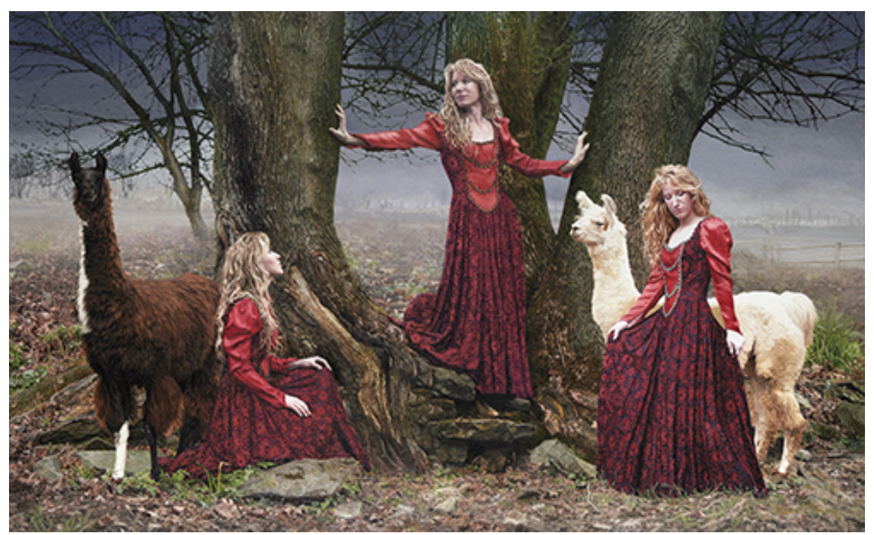
"Triplets with Llamas" oil on canvas, 25.5" x 42"

A major body of work is my Triplets Series . I wanted to glimpse into the secret lives of three sisters who all share the same exact birthday and DNA. I got the idea for this from the close relationship I have with my older sister and wondered what it would be like to have been a member in a tribe of multiples.