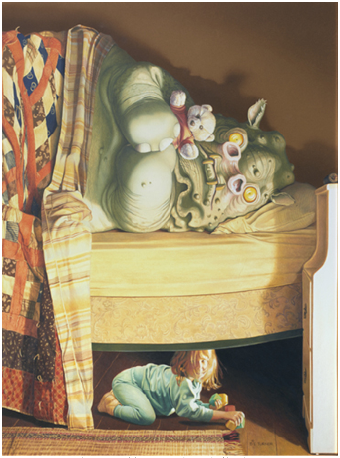
"Boogie Monster's Nightmare" gouache on Bristol board, 20" x 15"

I try to give the environment the same consideration to detail as the figures. By paying careful attention to soft versus hard edges, warm and cool light, and depth of field, the figures and their environment are physically, emotionally and visually intertwined.