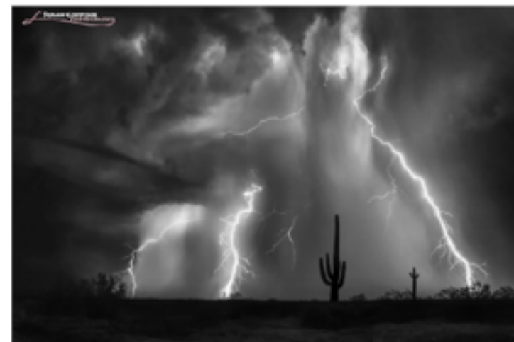
Quartzsite Saguaro 20 x 30 Photograph $975.00