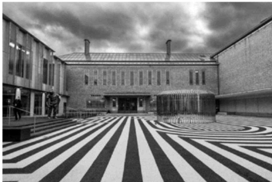
JULIE O'CONNER Courtyard Boijmans, Rotterdam, The Netherlands 18" x 12" $250.00