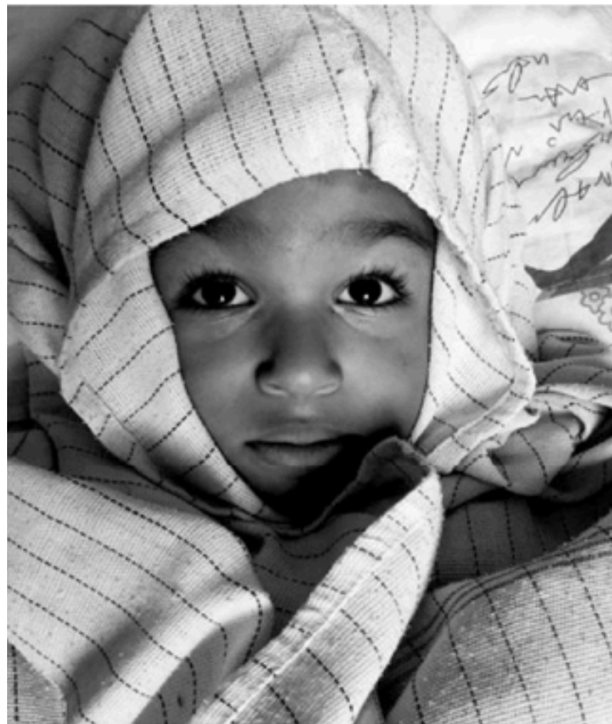
LARISA WAYA Peace 18" x 24" NFS