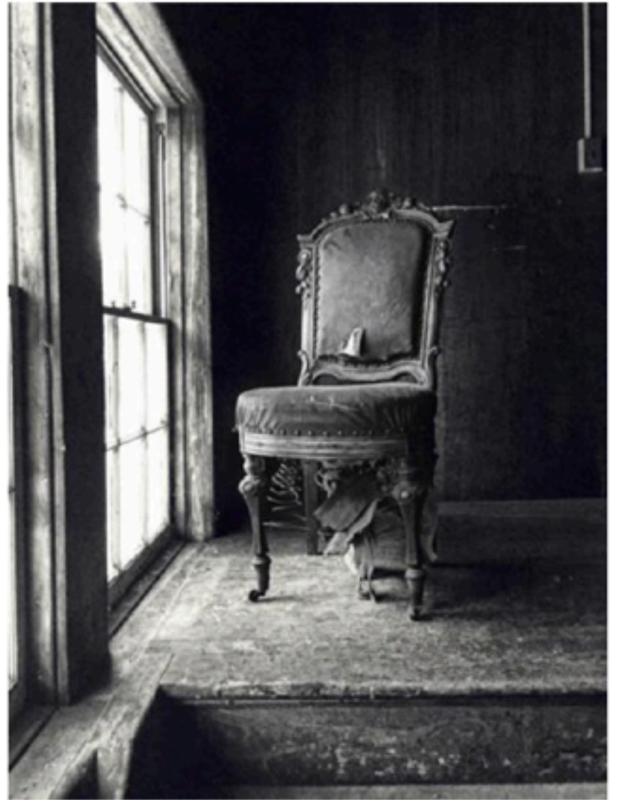
PHYLISS SHENNY Still Waiting 2 8" x10" $175.00