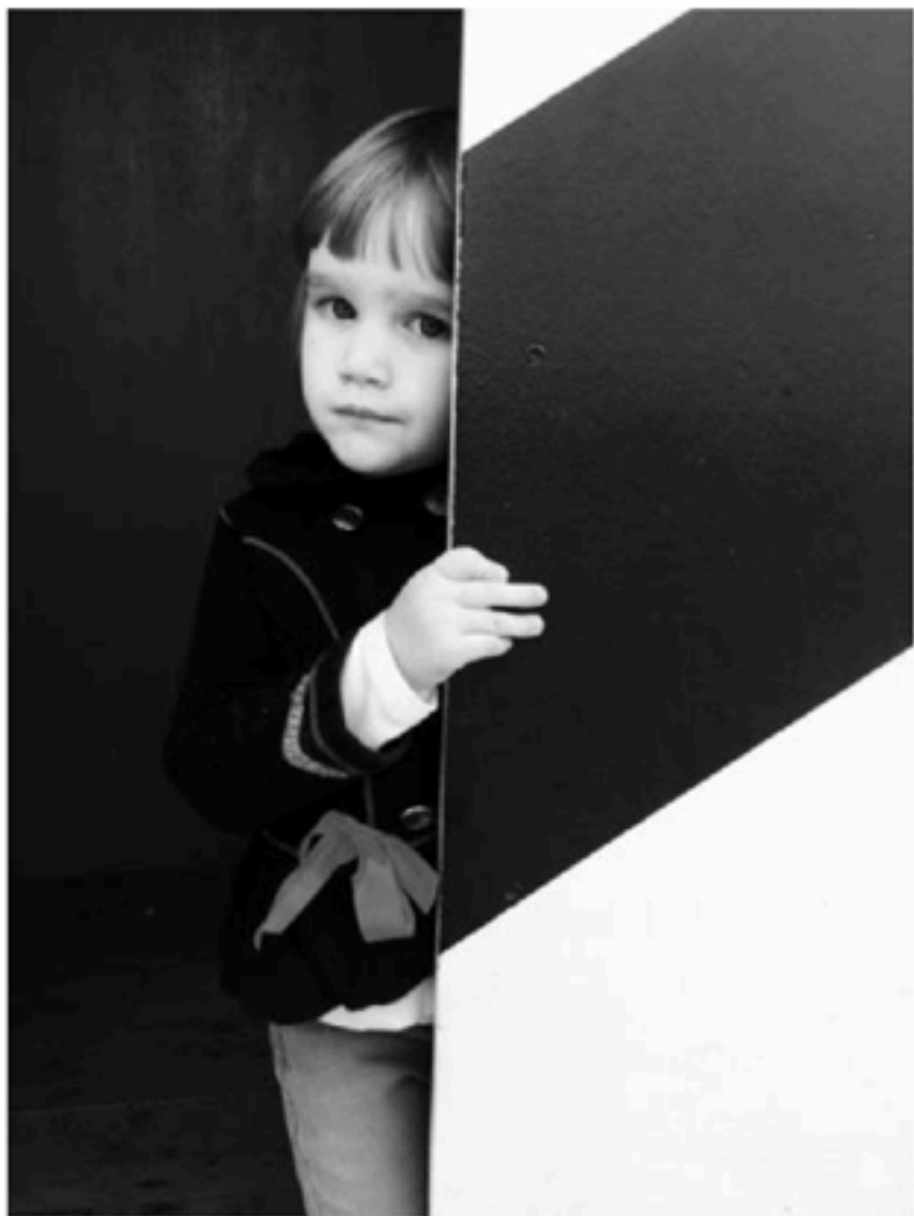
LARISA WAYA Do You See the World in Black and White? 18" x 24" NFS