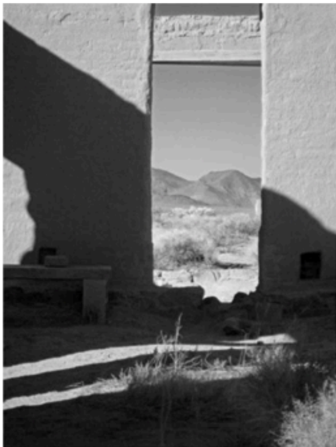
CAROL MCLEOD Fort Churchill 6" x 8" $250.00