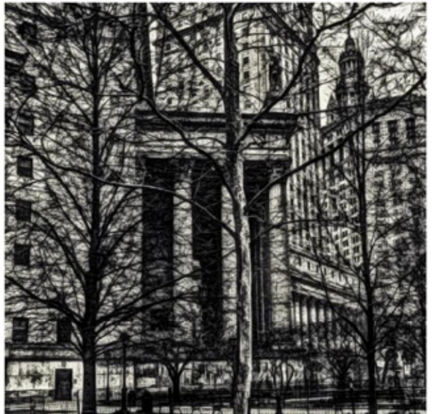
PHYLLIS SHENNY Driving By 10" x10" $175.00