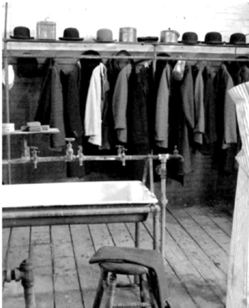
DOREEN E. VALENZA Workplace 9" x 12" $250.00