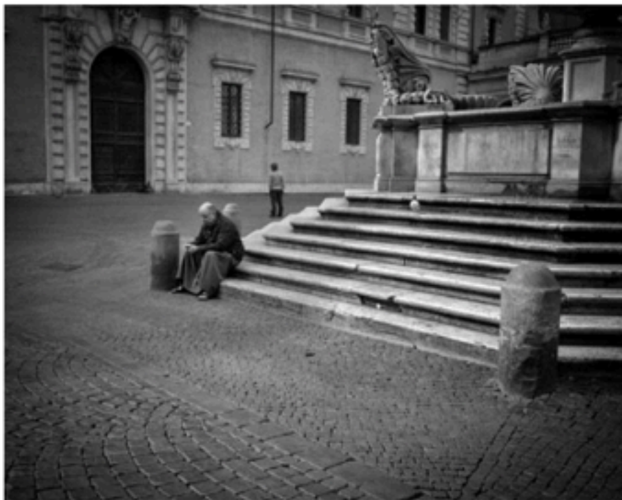
PENELOPE BREEN Trastevere Piazza 25" x 20" $750.00