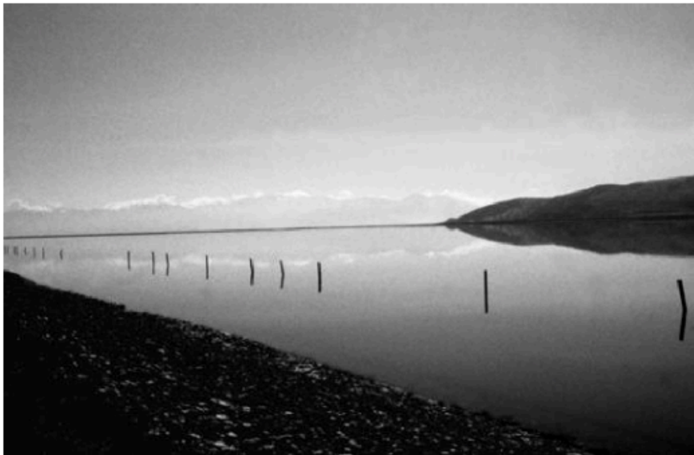
Susan Hammond Wood Posts at Salt Lake 16" x 20" $400.00