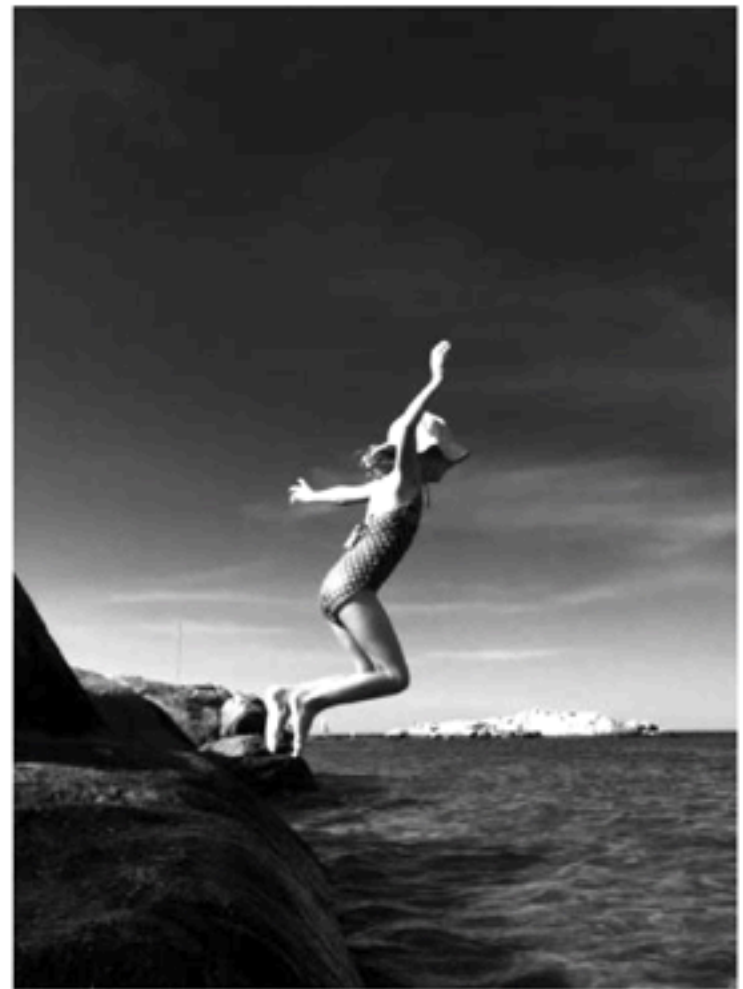
STOREY HIERONYMUS HAUCK Beach Flight 8" x 10" $650.00