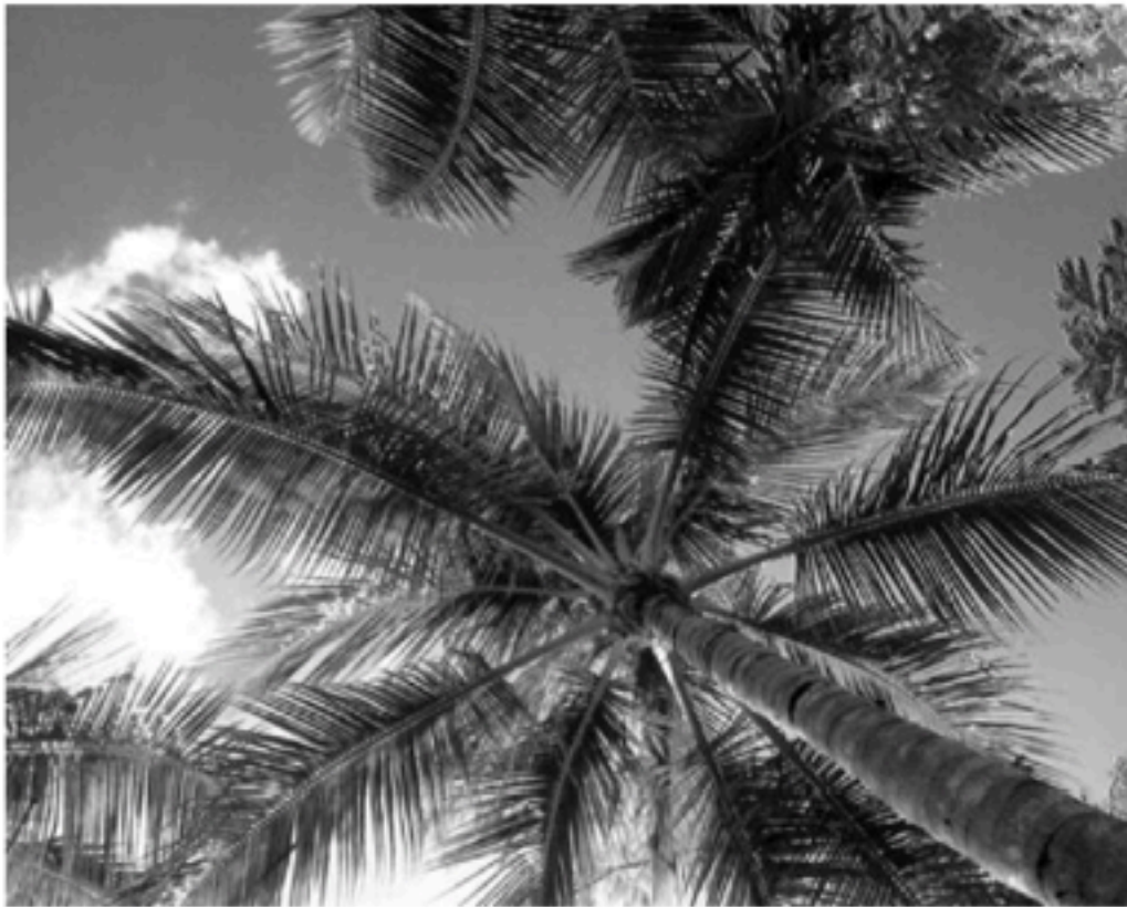
CAROYN ROGERS Palm And Clouds 5' x 7" $650.00