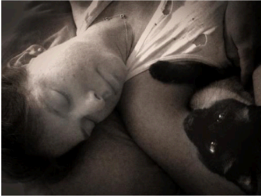
PATRICA BRODY We Are Siamese 8" x 10" $50.00