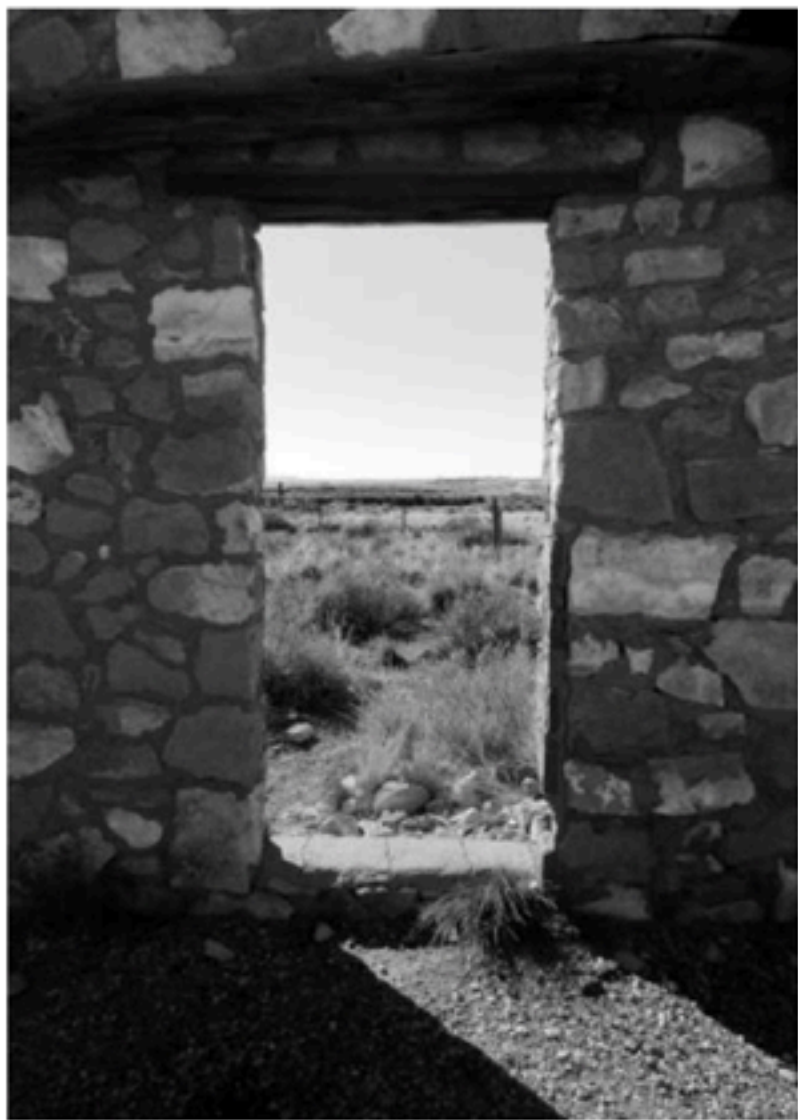
RHONDA M THOMAS URDANG Porta al Canyon Diablo 20" x 16" $500.00