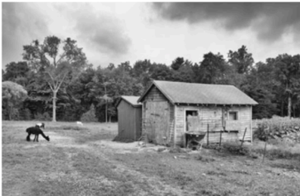
JANICE COHEN Before the Storm 13" x 19" $500.00