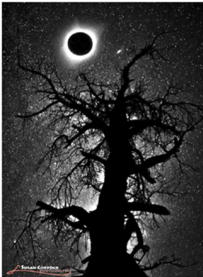
SUSAN COPPOCK We Are Stardust 16" x 24" $875.00 Award Winner