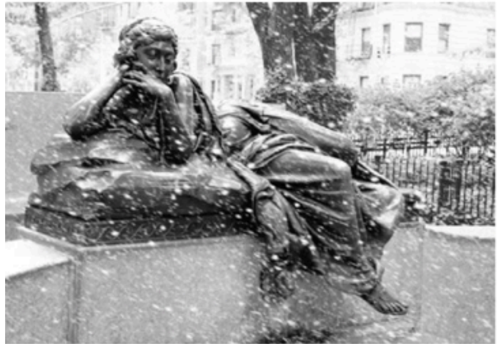
PATRICA BRODY It Is Snowing On Memory 8" x 10" $250.00