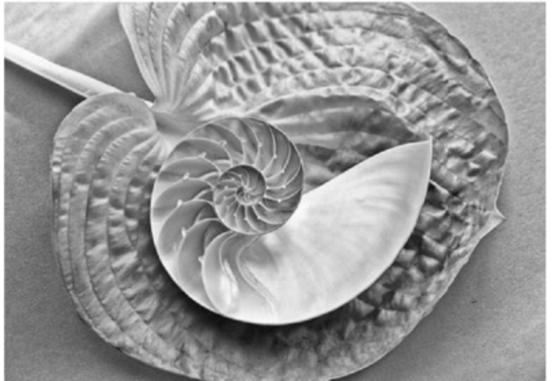
LIBBY COLLINS Resting 13" x 18" $350.00