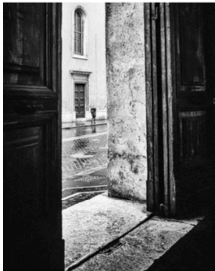
PENELOPE BREEN Solitary Walker 25" x 20" $750.00