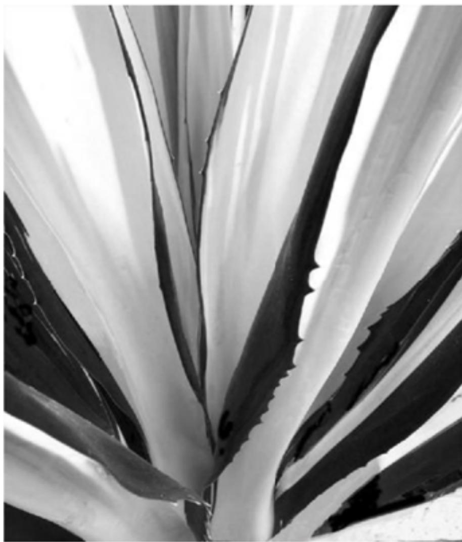
CAROL BRODY Yucca #1 20" x 24" $250.00