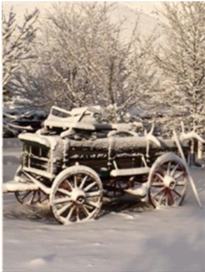
ELIZABETH HAMMOND COX Winter Wagon 14" x 11" $200.00