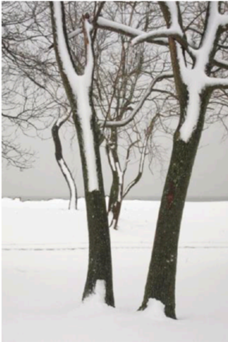
LIBBY COLLINS After the Storm 13" x 20" $400.00