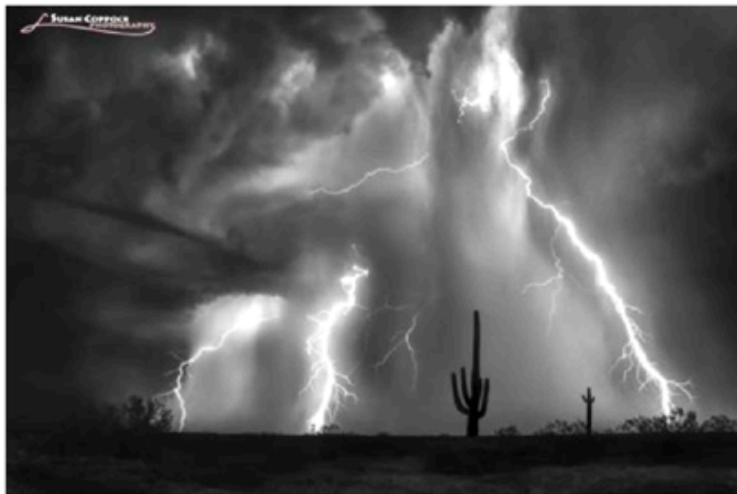
SUSAN COPPOCK Quartzsite Saguaro 20" x 30" $975.00 Award Winner