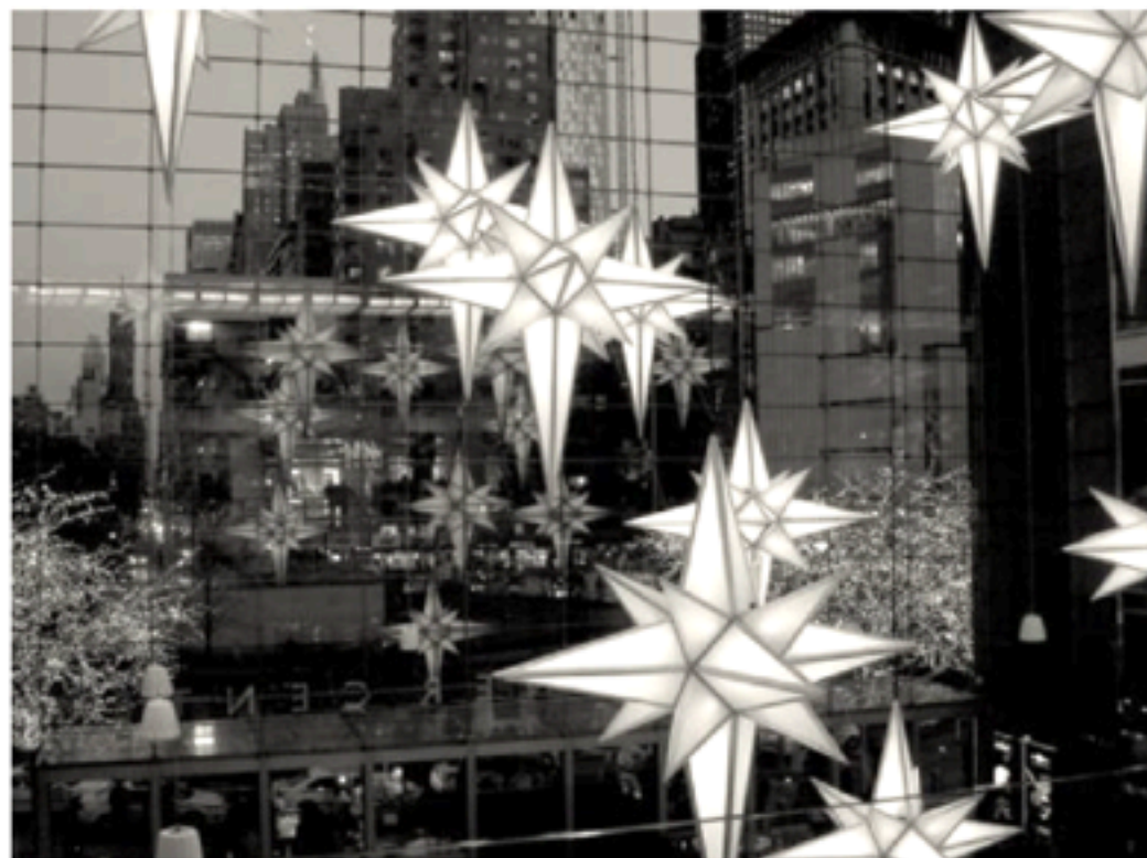
DOREEN E. VALENZA Starlight 9" x 12" $250.00