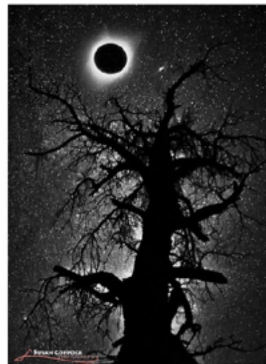
We Are Stardust 16 x 24 Photograph $875.00

I am a storm chaser and nature photographer. Most of my work is night photography of the Milky Way, star trails, moon shots (including the 2017 Solar Eclipse), and thunderstorms including cloud formations and lightning. The title of my show "We are Stardust" refers to the feeling I get when surrounded by the night sky & the power of nature and her fury. I try to showcase the awe and spirit I feel during these times in my photography. I like to share this feeling with others who may not be as fortunate to witness what I do in my travels.