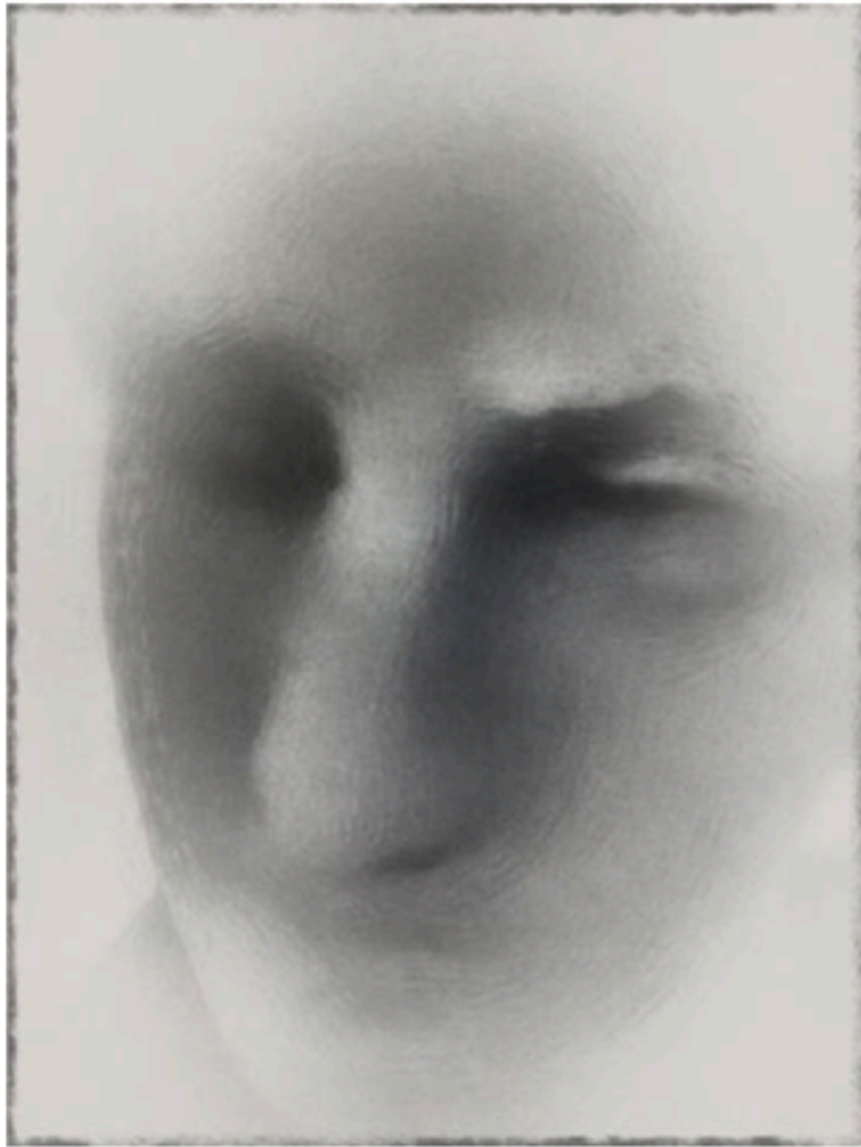
PHYLLIS SHENNY She's Just Sitting on a Shelf 12" x16" $225.00