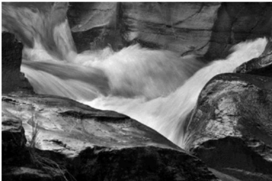
JANICE COHEN Rushing Waters 13" x 19" $500.00